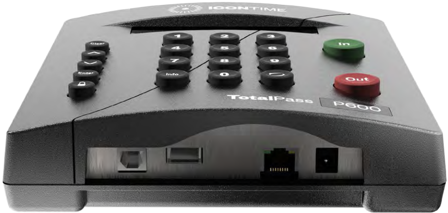
TotalPass P600 Time Clock

The TotalPass P600 time clock includes three connection options: Wi-Fi, Ethernet, or USB.