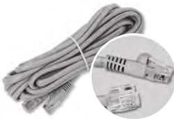
15' Ethernet Cable