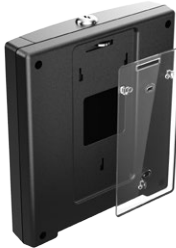
Back View with Mounting Bracket