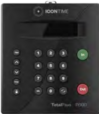
TotalPass P600 Time Clock

Below are the contents included with your TotalPass P600 time clock. If anything is missing, please contact our support line for a replacement: 1-800-847-2232.